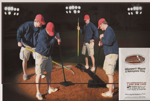
Hilltopper Mound Clay

Save valuable time and money working on your pitching mounds with Hilltopper's Mound Clay. The clay has a patented polymer technology which replaces moisture content. Use the clay right out of the bag with a proprietary double screening process, and waterless eliminates the variability that comes with water and clay particles.