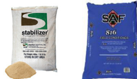
Stabilizer and Field Dry