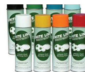
Paint and Chalk

Order your field products from Victory Mounds to help your field lead the league in quality, playability, and visual appeal.